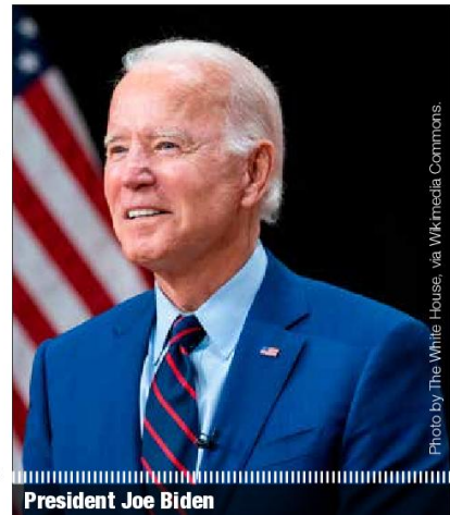
President Joe Biden