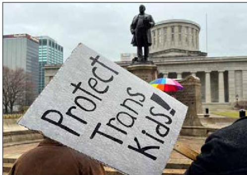
Demonstrators advocating for transgender rights and healthcare stand outside of the Ohio Statehouse, Jan. 24, 2024, in Columbus, Ohio. A federal appeals court on Wednesday, July 17, refused to lift a judge's order temporarily blocking the Biden administration's new Title IX rule meant to expand protections for LGBTQ+ students.