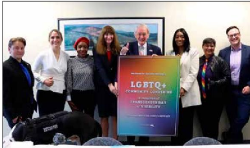
see MARKEY , page 2

Amid the state of emergency that transgender and nonbinary people in Massachusetts and across the United States are experiencing – including increasing reports of violence,