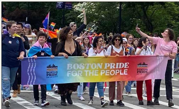
Boston Pride Parade 2023.