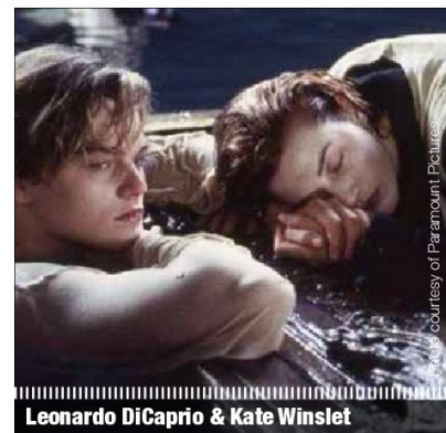
Leonardo DiCaprio & Kate Winslet