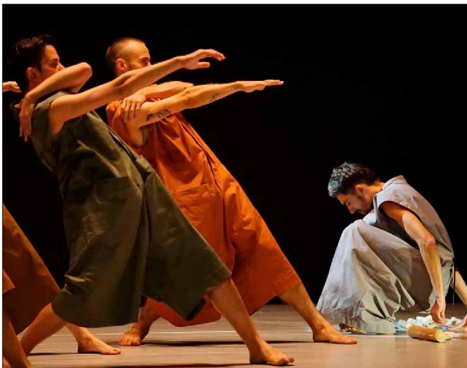
Vertigo Dance Company members in “MAKOM”—a Celebrity Series offering to be staged at Shubert Theatre.

“It’s a bridge they (the dancers) are building through the show,” Noa explained. Sometimes there will be a circle representing community. “We have to support each other and be together. We should be one,” she continued. “The circle can be like a folk dance,” she added. At other moments, dance movement will suggest a Shevil—Hebrew for ‘path.’ That path may connect with the creation of “a bridge connecting between two different peoples.” Some moves