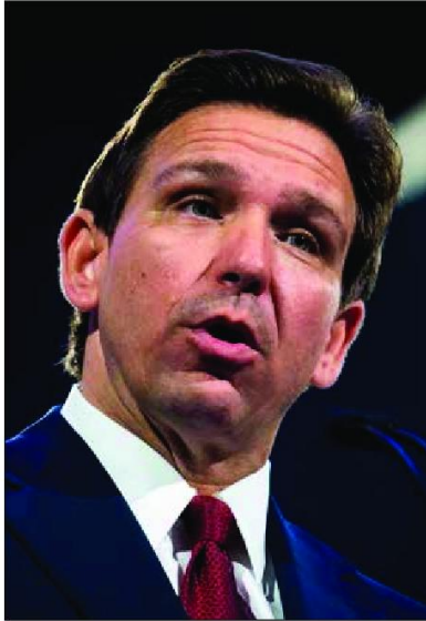
Florida Governor, Ron DeSantis.

Enforcement is blocked in two states besides Florida, and