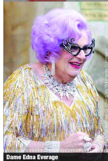
Dame Edna Everage