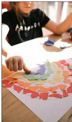
see MOMBIAN , page 4

Remember that much education happens at home. Perhaps not the academic subjects (although some of us