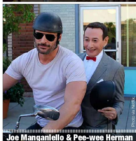
Joe Manganiello & Pee-wee Herman