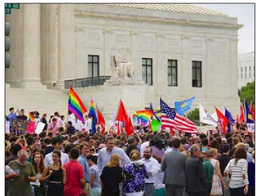
see SCOTUS , page 2

"What if, for example, [Lorie] Smith [the website designer who brought the case] had instead asserted