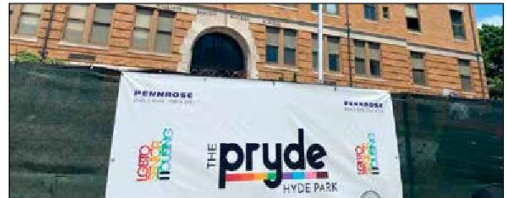
A sign for The Pryde affordable housing development hangs on a fence outside the old William Barton Rogers School, which will be converted into apartments, during the project's groundbreaking ceremony on Friday, June 17, 2022.

rently under construction, is slated to include 74 mixed-income rental units in addition to a public community center. A housing lottery is expected to be held in the fall, with the building to open within six months.