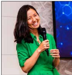
Mayor Michelle Wu.