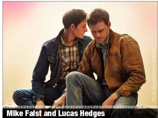
Mike Faist and Lucas Hedges