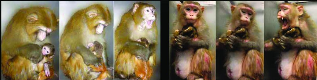
*Monkey images: Figures 1 and 2 in "Injuries for Mother Love (July 2004)" by Margaret S. Langston (04/15/07/28) | CC BY-NC-ND (04/15/07/28)