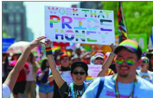
Boston Pride 2019.

BOSTON – Boston Pride For The People (BP4TP) announced the return of a Pride Month celebration in Boston. The celebration will be held in June 2023, and will include a parade, a festival, block parties, and more. The parade and festival will take place on Saturday, June 10th on Boston Common and at City Hall Plaza. Other activities will