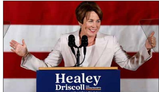
Massachusetts Gov.-elect Maura Healey speaks during a Democratic election night party Tuesday, Nov. 8, 2022, in Boston.

Russian officials put Griner on trial in early July and declared her to be guilty. In August, they announced she was sentenced to nine years in prison. More than three months went by before the White House suddenly announced it had reached an agreement with Russian officials to exchange the arms felon for Griner. On December 8, Griner was freed and flew back to the U.S. She issued a statement December 16, thanking all the people and fans who provided love and help. She also noted that she will be playing with the Phoenix Mercury again next season.