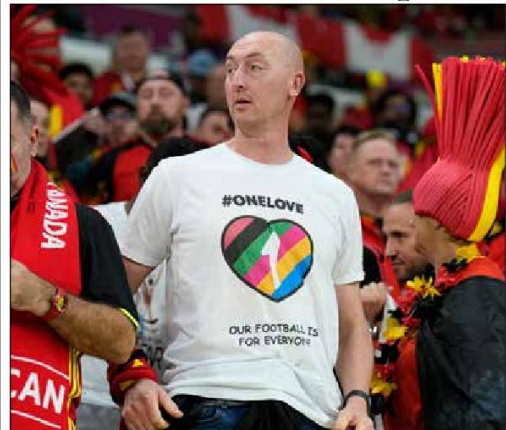
Germany's supporter wearing a rainbow jersey waits for the World Cup group F soccer match between Belgium and Canada, at the Ahmad Bin Ali Stadium in Doha, Qatar, Wednesday, Nov. 23, 2022.