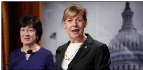
Sen. Tammy Baldwin, D-Wis., joined at left by Sen. Susan Collins, R-Maine, speaks to reporters following Senate passage of the Respect for Marriage Act, at the Capitol in Washington, Tuesday, Nov. 29, 2022.

WASHINGTON (AP) — The Senate passed bipartisan legislation Tuesday to protect same-sex marriages, an extraordinary sign of shifting national politics on the issue and a measure of relief for the hundreds of thousands of same-sex couples who have married since the Supreme Court's 2015 decision that legalized gay marriage nationwide.