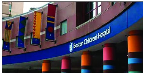
see BCH , page 7

BOSTON (AP)—Federal authorities on Thursday arrested a woman accused of calling in a fake bomb threat at Boston Children's Hospital amid a barrage of harassment and threats of violence over its surgical program for transgender youths.