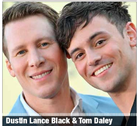
Dustin Lance Black & Tom Daley