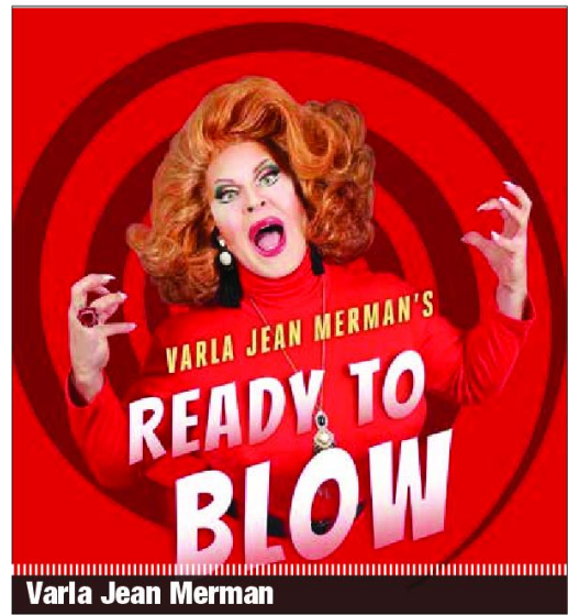
Varla Jean Merman

When anyone is wearing a sock to a gay orgy, it's definitely time to end yet another column. Obviously it wasn't moi! To paraphrase someone famous —I've known orgies, and that's no orgy. But you can find more than your fill at www.BillyMasters.com —the site that's like a virtual orgy —but you won't lose your socks! If you have a gap that only I can fill, send specifics (and photos) to Billy@BillyMasters.com , and I promise to get back to you before someone invites Jared Padalecki to an orgy! Until next time, remember, one man's filth is another man's bible.