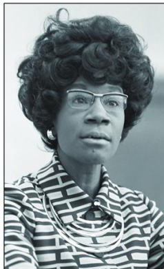
Shirley Chisholm.