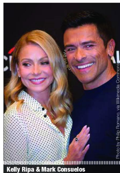
Kelly Ripa & Mark Consuelos