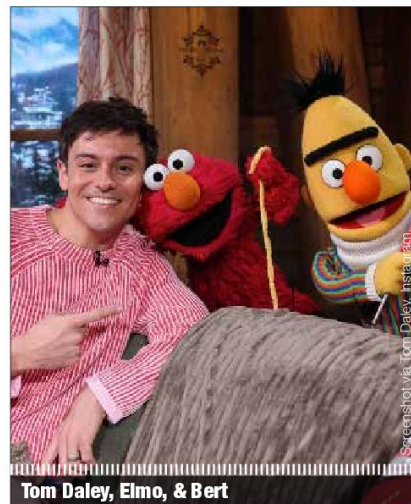
Tom Daley, Elmo, & Bert