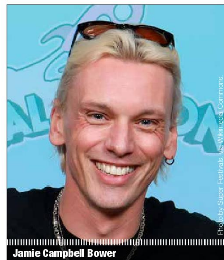
Jamie Campbell Bower