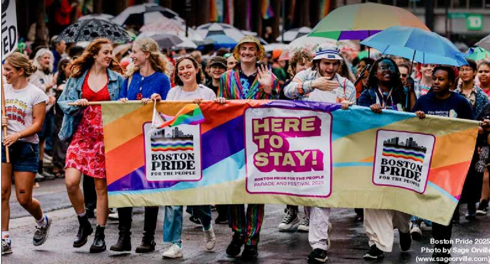
Boston Pride 2025.