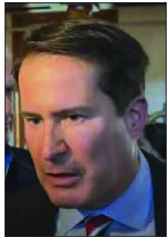
Congressman Seth Moulton.